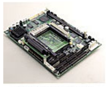
Mounted on PCM-9559 SBC

The Ricoh chipset is a proven performer. The National Software Testing Laboratories (NSTL) has certified this chipset for all the major operating systems. Microsoft has also certified this chipset for most of their major operating systems as well. So rest assured, this module is ready to operate flawlessly with any embedded system.