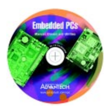
EPC's manuals and drivers CD-ROM

A new CD-ROM filled with all of Advantech EPC's current manuals and drivers for its Biscuit and Slot PC products is now available. By putting all of this