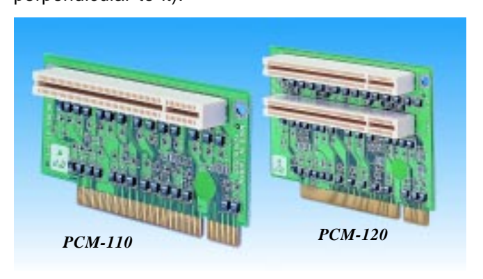
Riser Cards from Advantech

Advantech offers a large selection of riser cards for both full-size Biscuit PCs and POS control boards. They come in a wide-range of sizes, from one slot to three, and types, from PCI- to ISA-bus. The advantages of using riser cards are 1) multiplying the number of PCI or ISA expansion slots available (possibly saving on-board space in the process), and 2) saving vertical space (above the board) by allowing one to add expansion cards parallel to the main board, verses perpendicular to it).