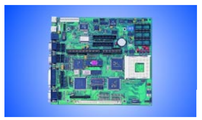
POS-460 Rev.B1 486-based POS Control Board

Advantech's popular and long-lasting 486-based POS control board, the POS-460, has recently been revamped, from version A2 to version B1. Several small but important changes have been made. One result is that there is much better keyboard functionality at high temperatures. Another design change was prompted by the phasing out of the DIP package cache memory chip. To replace it, Advantech chose an SOJ (surface mount) chip which features 128 KB or optional 512 KB of cache memory. The third significant modification made was the substitution of the C&T 65545 VGA/LCD controller chip with the newer and more stable C&T 65550. This new chip supports even more types of LCDs and higher resolutions (800 x 600).