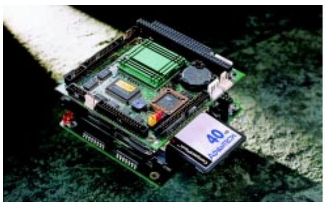
PCM-3345 486 PC/104 CPU Module

At only the size of a industry-standard PC/104 module, Advantech's new PCM-3345 486-based SBC is a fully-featured, industrial-strength SBC fit for the most space critical embedded applications one can think of. Its small size gives it a solid structure, while its PC/104 form factor is small, simple and reliable. It is also easy to expand and rugged enough to function well in harsh environments.