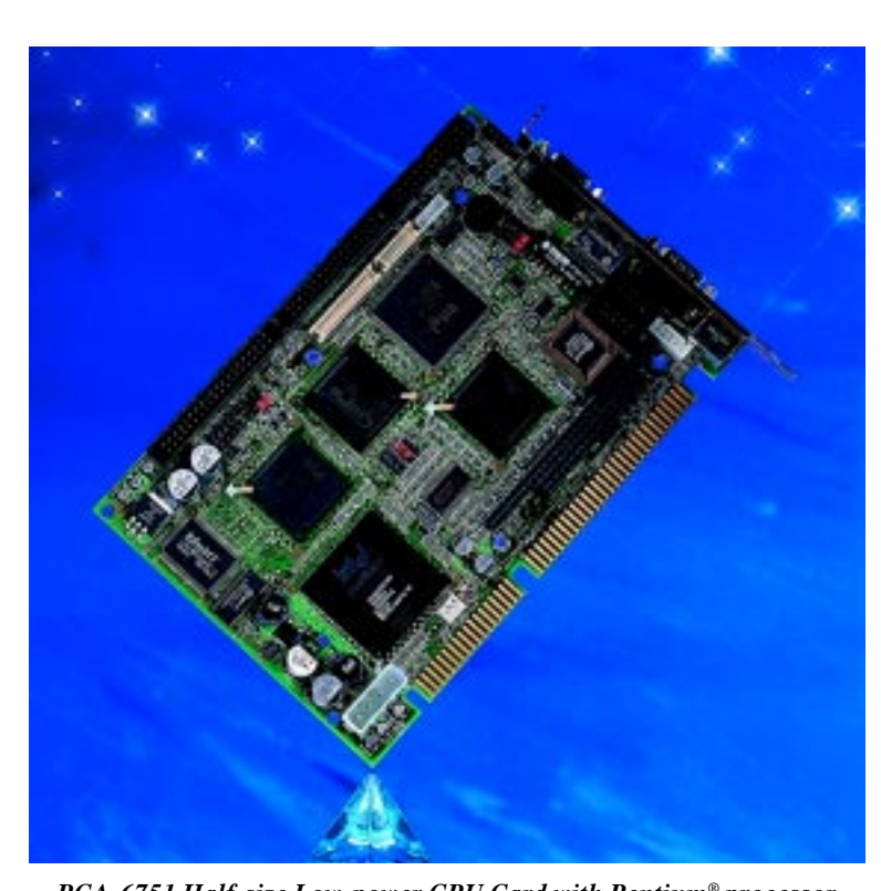
PCA-6751 Half-size Low-power CPU Card with Pentium ^{\circ} processor

Advantech's new half-size CPU card, the PCA-6751, is an extremely low power Pentium® processor-based card which is ideal for embedded applications. This feature allows the PCA-6751 to operate in high-temperature environments without a fan. Fanless operation