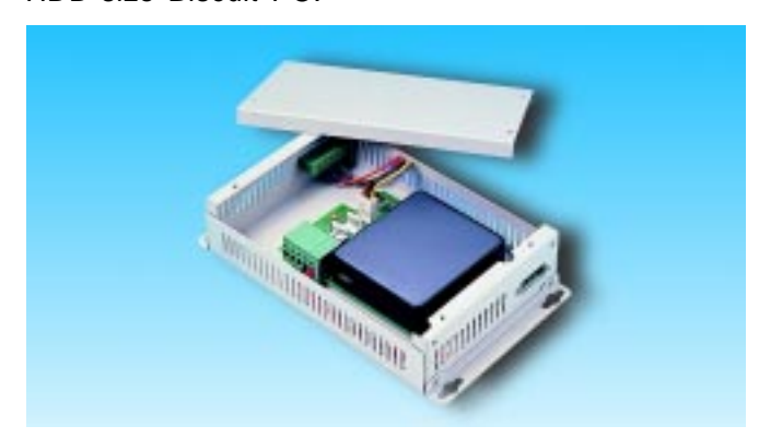
PS-25D 25 W DC-DC Power Supply

Advantech has recently added yet another option for the seekers of total embedded PC solutions: the PS-25D. This new product is a 25 W DC to DC power supply built especially for Advantech's MBPC-200 MicroBox 3.5" Biscuit PC Chassis and Advantech's series of 386, 486, and Pentium® processor-based 3.5" HDD-size Biscuit PC.