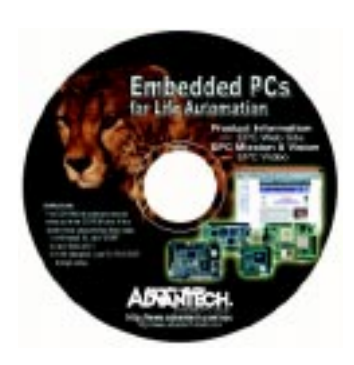
EPC promotional CD-ROM

information on one disc, it not only simplifies the production and distribution of product related materials, but it also provides the customer with detailed information helping in possibly choosing a product for their new or next generation application.