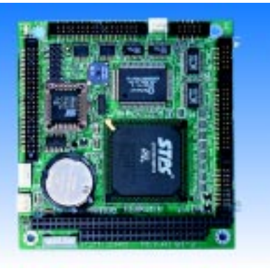
A Small yet Rugged and Reliable Embedded Solution

The versatility, size and cost of the PCM-3345 allow for space-critical and/or harsh environment applications not even considered possible in the recent past. Additionally, this board can function well without a fan in environments of up to 70°C, opening up even more embedded application possibilities. Applications in vehicles or high vibration/shock environments are well suited to the PCM-3345, as are rugged, handheld or mobile computing and monitoring devices. Other application possibilities include small business demonstration or exhibition devices, and "hidden" monitoring or data sampling and/or routing devices, among a host of others.